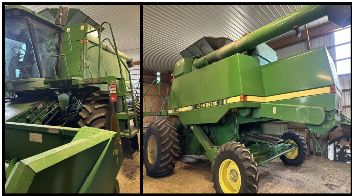
JD 9500 Combine