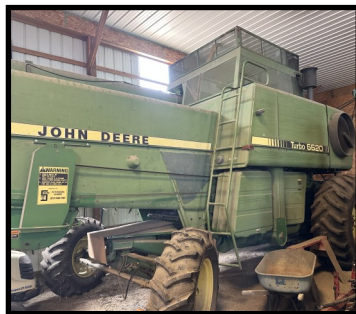
JD 6620 Combine