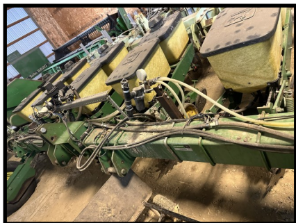
JD 7100 Planter 6 row 36", fertilizer & band sprayer in rear